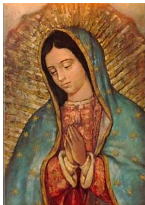
Our Lady of Guadalupe December 12 Patroness of all the Americas

Monday December 10 Advent Weekday Is 35:1-10 Lk 5:17-26 Tuesday December 11 Advent Weekday Is 40:1-11 Mt 18:12-14 Wednesday December 12 Our Lady of Guadalupe Zec 2:14-17 or Rv 11:19a; 12:1-6a, 10ab Lk 1:26-38 or Lk 1:39-47 Thursday December 13 St. Lucy, Virgin and Martyr Is 41:13-20 Mt 11:11-15 Friday December 14 St. John of the Cross, Priest and Doctor of the Church Is 48:17-19 Mt 11:16-19 Saturday December 15 Advent Weekday Sir 48:1-4, 9-11 Mt 17:9a, 10-13 Sunday December 16 Third Sunday of Advent Zep 3:14-18a Phil 4:4-7 Lk 3:10-18